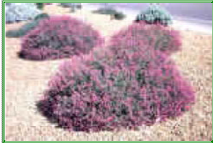
Dalea frutescens Sierra Negra™

habit. Cerro Azul™ was selected from a group of 100 seedlings for its showy spikes of blue-purple flowers. Now, for the exciting part... Cerro Azul™ is a winter bloomer! Flowers appear in the fall, and continue through winter and spring. While this plant prefers full sun exposures, it is tolerant of most soil types, including those with high clay contents. Greg suggests that you cut these plants back by half for the first three or four years to encourage denser growth and more flower production. Since this shrub is not bothered by rabbits, you cannot rely on them to do your pruning for you! Cerro Azul™ is hardy in Tucson, and we suspect that it will tolerate temperatures down to 10 degrees F.