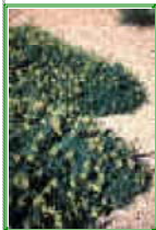
Dalea capitata Sierra Gold™