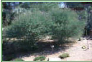
Dalea bicolor var. bicolor Monterey Blue™