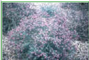
Dalea versicolor var. sessillis Mountain Delight™

When Sierra Moonrise™ blooms in the late fall, the contrast between the deep green foliage and the yellow flowers is striking. In warmer areas this shrub is evergreen, but where temperatures drop to the mid-20's, it becomes partly deciduous. We know that Sierra Moonrise™ tolerates temperatures as low as 17 degrees F, but it has not been sufficiently tested at lower temperatures. Plant Sierra Moonrise™ in full sun or part shade, and allow plenty of room, since this shrub can grow to 6 feet tall and wide. As suggested for Cerro Azul™, cut back plants by one half to two thirds in late winter to encourage dense growth and more profuse fall flowering. Rabbits do munch on this dalea when nothing else is available.