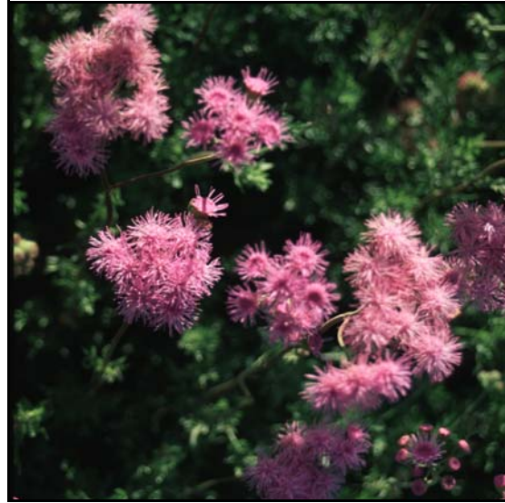
Close-up of the flowers of Eupatorium greggii .