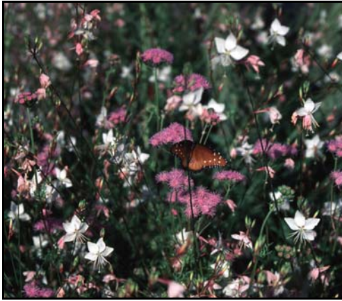
A butterfly feeds on Boothill™ , which is planted with Gaura lindheimeri .