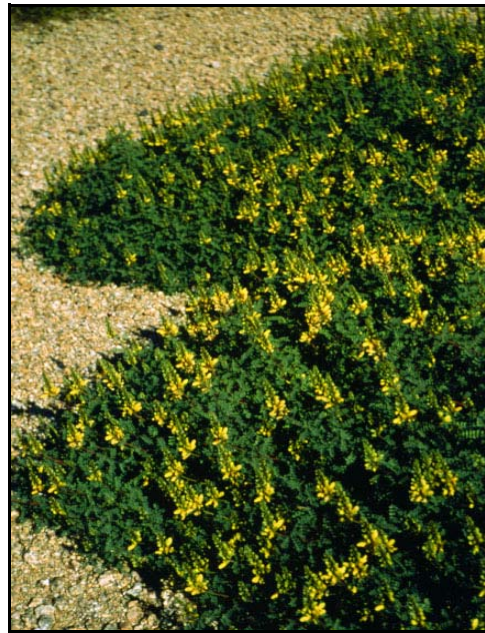
Sierra Gold™ in full bloom in the spring

For more information, call: toll-free (800) 840-8509 or (623) 247-8509 Mountain States Wholesale Nursery, PO Box 2500, Litchfield Park, AZ 85340-2500