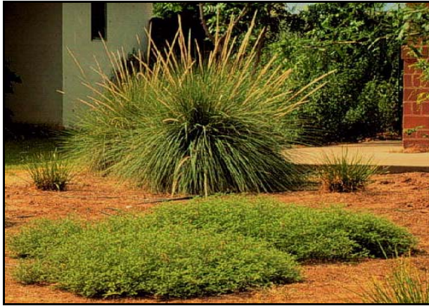
Dalea capitata Sierra Gold™ in a Phoenix landscape, with Muhlenbergia lindheimeri Autumn Glow™ in the background.