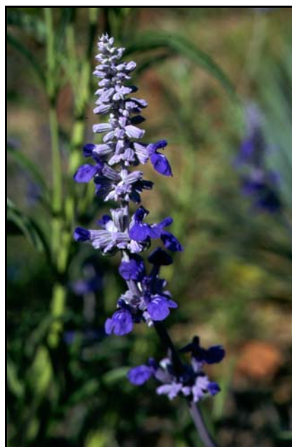
Close up of the flower spike of Salvia farinacea Texas Violet™.